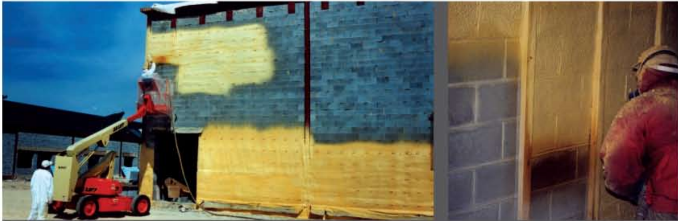
In the above curtain wall (CW) construction, 2-lb SPF is used to insulate the exterior of a building, helping to eliminate thermal bridging, while adding a secondary barrier against water penetration to the inside of the building. On the right, 2-lb SPF is used to achieve high R-value in a limited space.